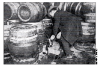
Illegal Booze Seized During Prohibition Raid

The 18th Amendment was passed in conjunction with the Volstead Act, an act which legally defined an alcoholic beverage and gave authorities the power to investigate and prosecute those who proved to be in violation of the anti-liquor laws.