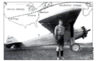
Charles Lindbergh and the Spirit of St. Louis

On 20 May 1927, after waiting eight days for favorable weather conditions, Lindbergh and his tiny, silver plane took off from Roosevelt Field in Long Island, New York bound for Paris, France. Over 33 hours and 3,600 miles later, after battling ice, fog and fatigue, "the flying fool" as he was known in