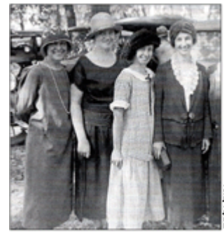
Flappers of the Roaring Twenties

The '20s also saw an unprecedented period of literary excellence that introduced both coveted and controversial works by the likes of Ernest Hemingway, F. Scott Fitzgerald and William Faulkner. Fitzgerald and Hemingway were part of a group of writers known as the "Lost Generation", eschewing